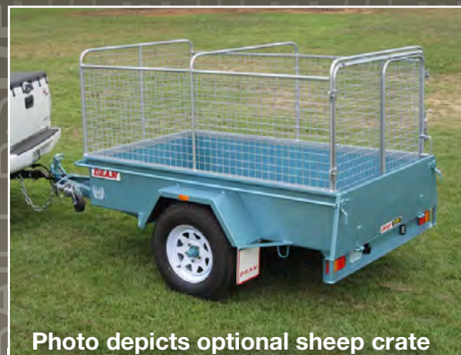
Photo depicts optional sheep crate

Stock crate or sheep crate to suit available with 2.0t capacity