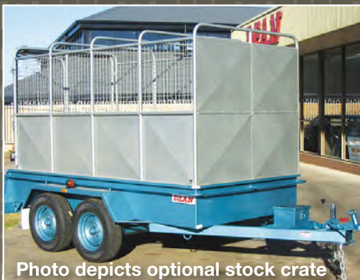
Photo depicts optional stock crate

Optional 2.3t capacity with breakaway brakes